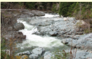
One of many riverviews on Hwy. #4