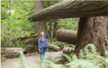
Cathedral Grove a must see!

460 Marine Drive, Ucluelet, BC V0R 3A0 • Vancouver Island FOR INFORMATION & RESERVATIONS CALL Toll Free: 1-888-936-5222 Tel: (250) 726-2686 Fax: (250) 726-2685 Email: info@awesomeview.com