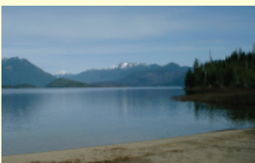
Breathtaking Kennedy Lake